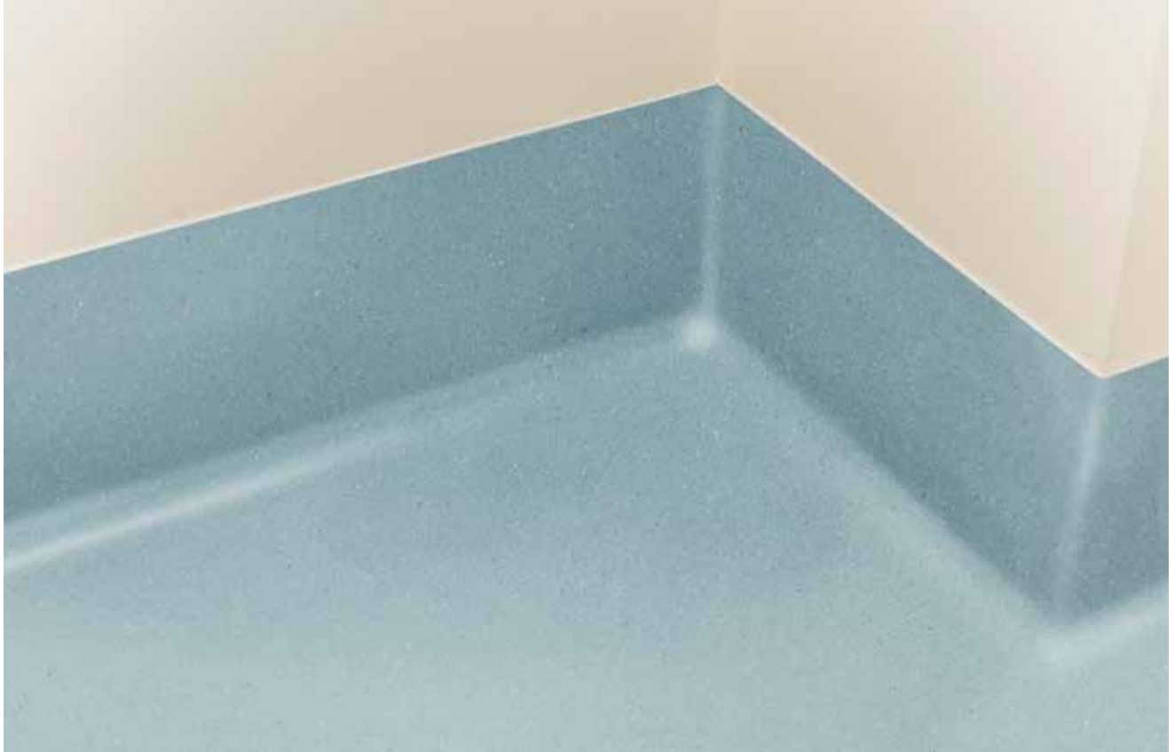
H2018 Tranquil Breeze

Superior infection control with heat welded seams for spaces demanding enhanced sterilization.