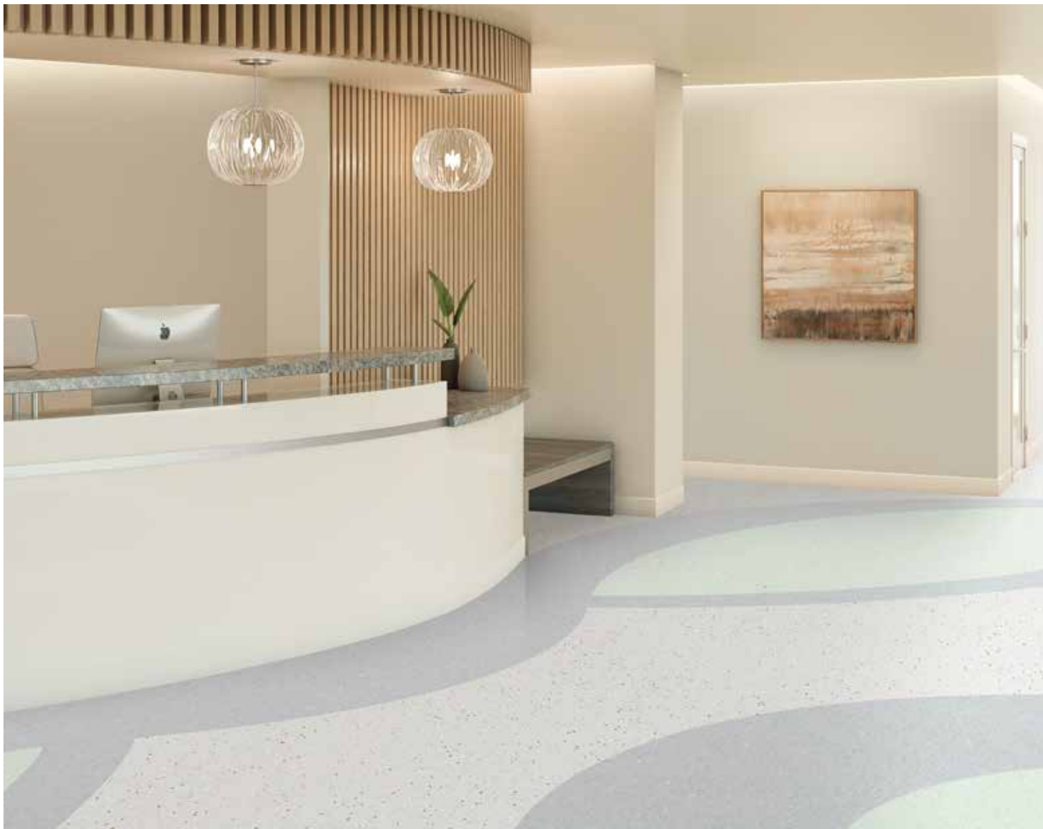
H2006 Calming Gray, H2027 Cedar, Natralis: 70001 White Rim