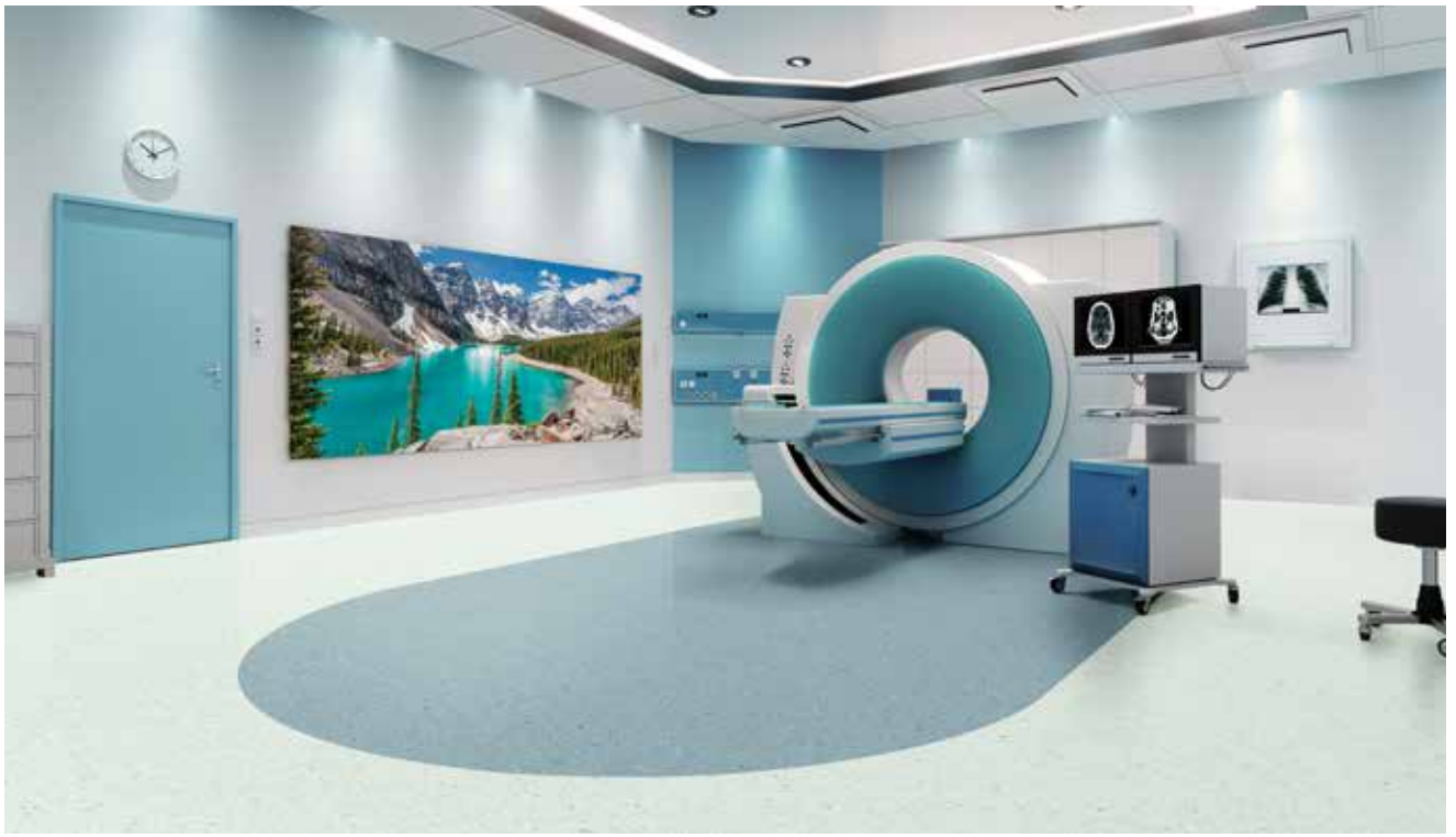
H2003 Sea Salt, H2029 Aegean Blue